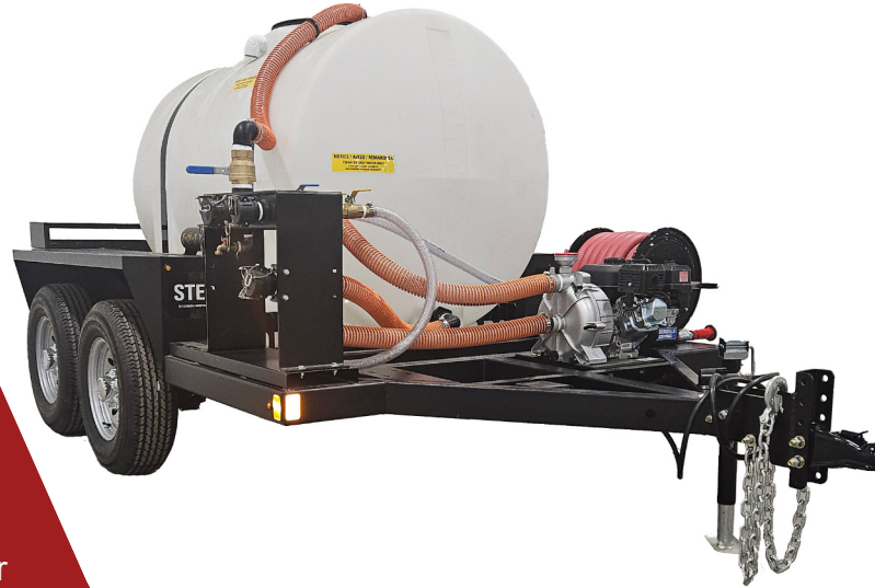
*Images shown may include optional features. Actual product appearance may vary based on selected configurations.

Built for demanding field use, the Simpson Water Trailer delivers dependable mobile water supply for dust control, washdown, irrigation support, and jobsite response.